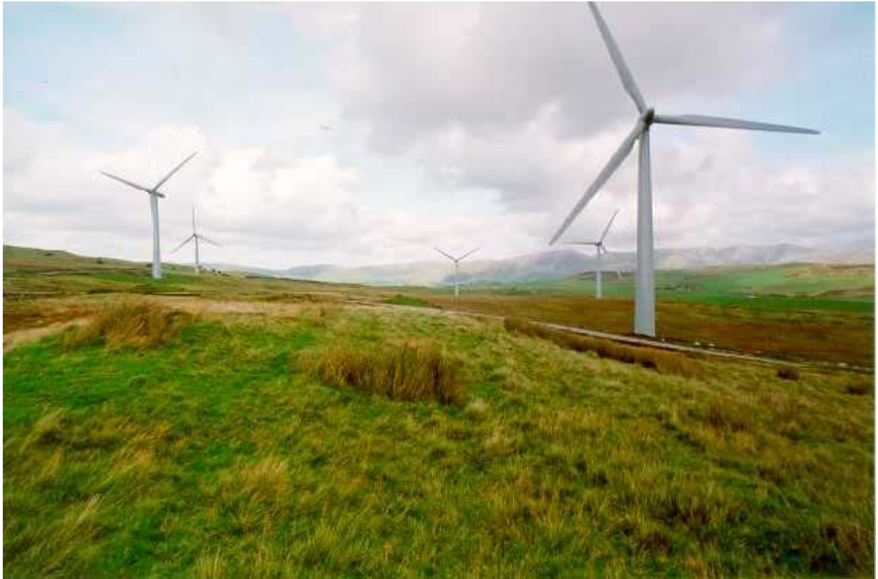
Lambrigg Wind Farm, Cumbria

The main points can be summarised as follows: