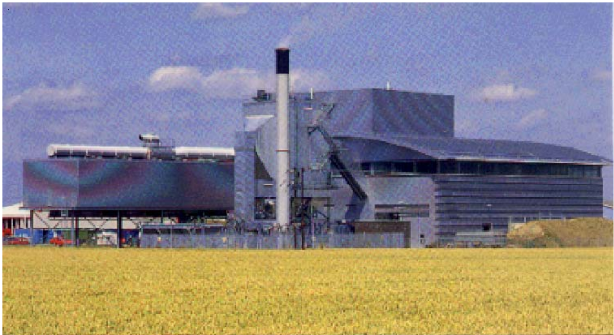
Eye Power Station, Suffolk

The main points can be summarised as follows: